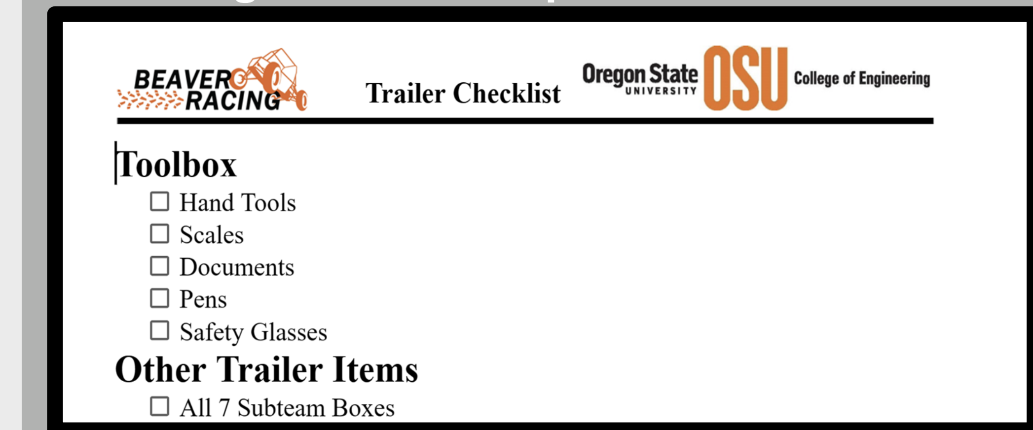
Figure 5: Toolbox Check list