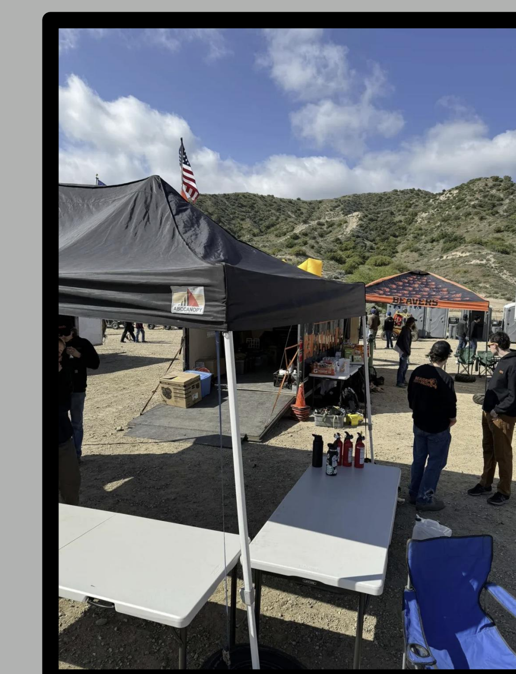
Figure 6: Competition day Trailer & Canopy Competition Layout