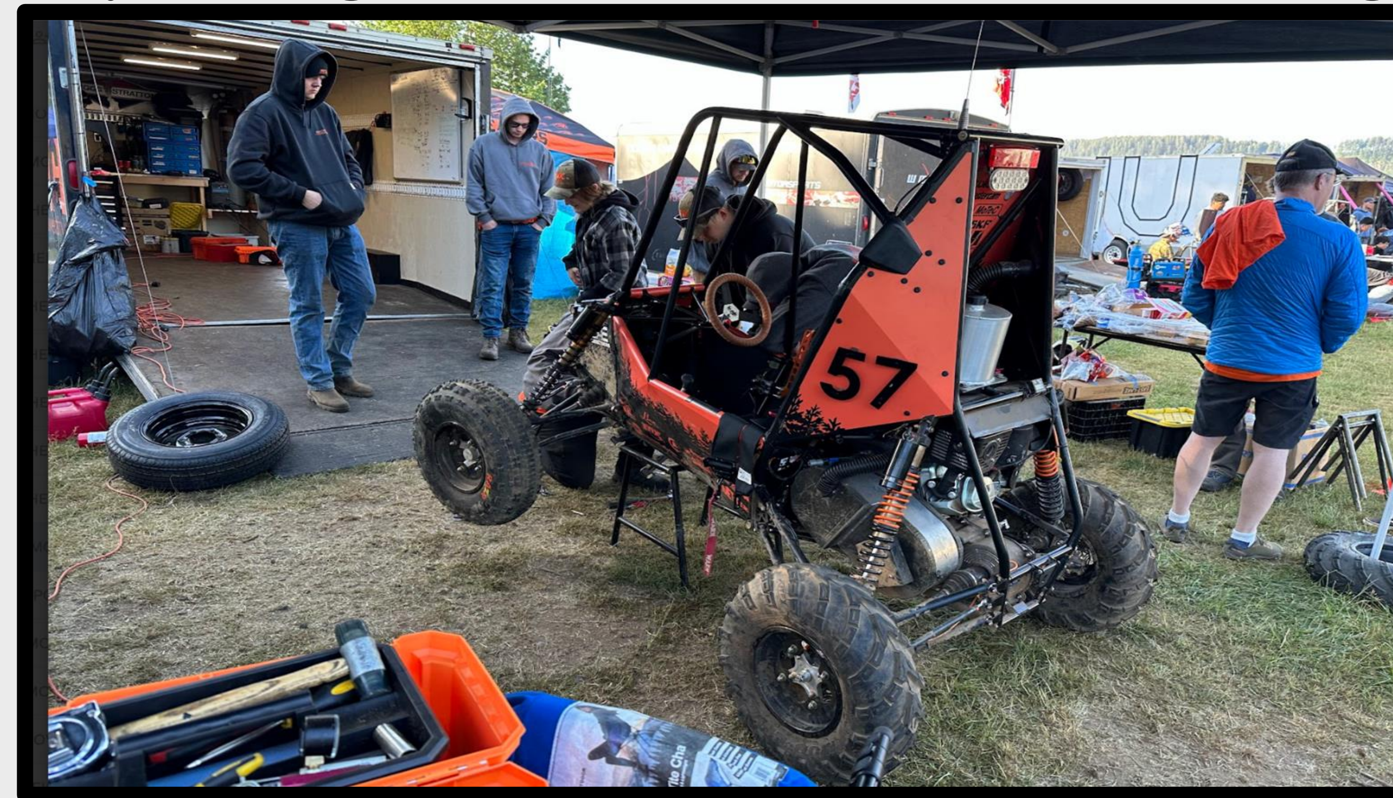
Figure 2: Trailer & Canopy Layout

Dylan Magaña, Eliceo Bernabe, Dustin Truong