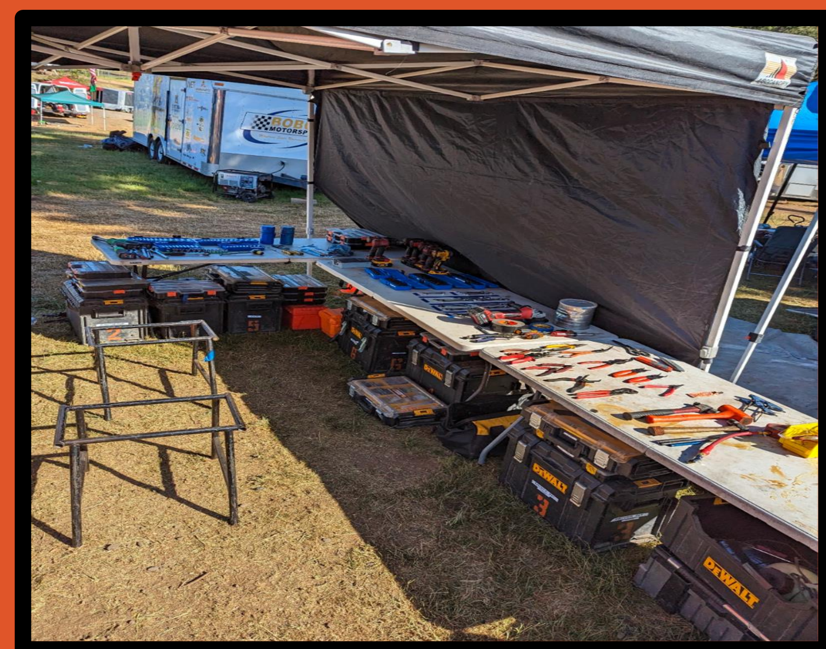
Figure 1: Subteam Boxes Layout